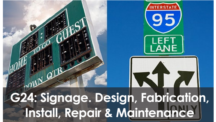
G24: Signage. Design, Fabrication, Install, Repair & Maintenance