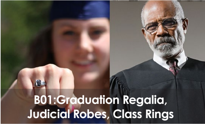
B01: Graduation Regalia, Judicial Robes, Class Rings

News to support your buying decisions, all in one place, all at one time, every time.